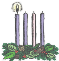
First Sunday in Advent

will focus on the figures in the nativity as the crèche is filled throughout the weeks.