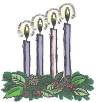
Fourth Sunday in Advent