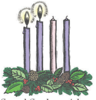
Second Sunday in Advent

"Something's About to Happen...Honestly!"