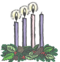
Third Sunday in Advent