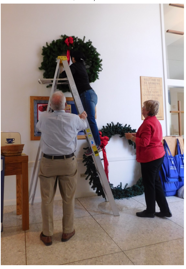
Join us after worship, December. 3, for Hanging of the Greens