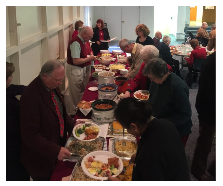
Christmas Pot Luck Luncheon

The Congregational Life Committee would like to invite the congregation to the annual Christmas Luncheon on Sunday, December 17, 2017 immediately after the 11:00AM service. It will be potluck so please plan to bring a dish to share. The signup sheets for the luncheon will be in the Gathering Area beginning on Sunday, November 26. Please sign up to bring a salad, a main dish, a side dish or a dessert. Also, please indicate the number of family members that will be attending. All are welcome to come and share a meal and fellowship with the St. Andrews family during this very special time of the year. After the meal we will be learning about the history and singing some of the season's favorite carols. We hope all can attend!